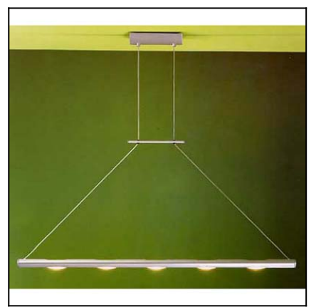
The photograph may not match the reference exactly. Please read the product description to identify the finish.