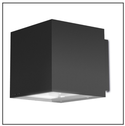
The photograph may not match the reference exactly. Please read the product description to identify the finish.