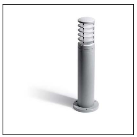
The photograph may not match the reference exactly. Please read the product description to identify the finish.