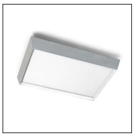
The photograph may not match the reference exactly. Please read the product description to identify the finish.