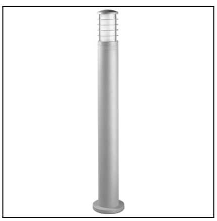
The photograph may not match the reference exactly. Please read the product description to identify the finish.