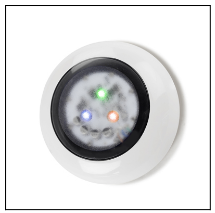
The photograph may not match the reference exactly. Please read the product description to identify the finish.