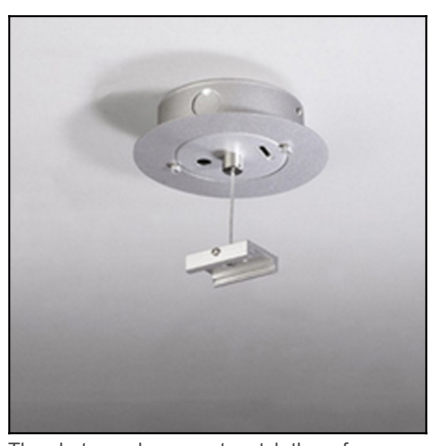
The photograph may not match the reference exactly. Please read the product description to identify the finish.