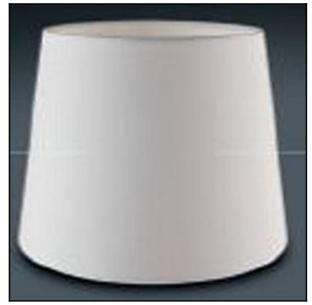
The photograph may not match the reference exactly. Please read the product description to identify the finish.